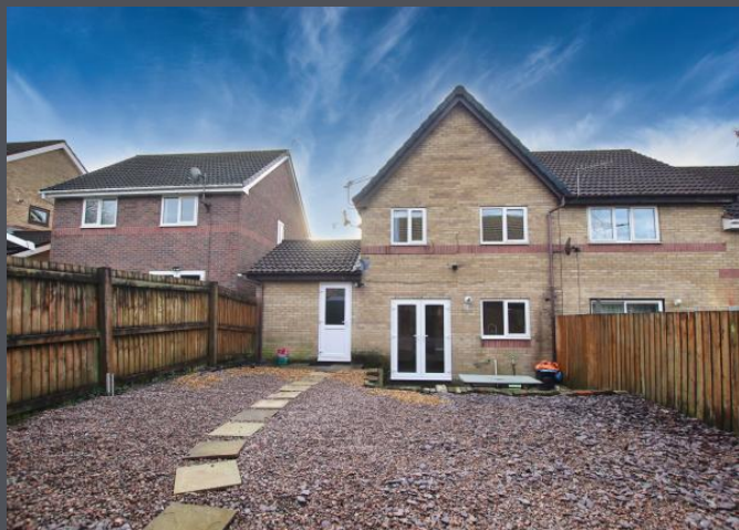
18 Badgers Brook, Brackla, CF31 2QS